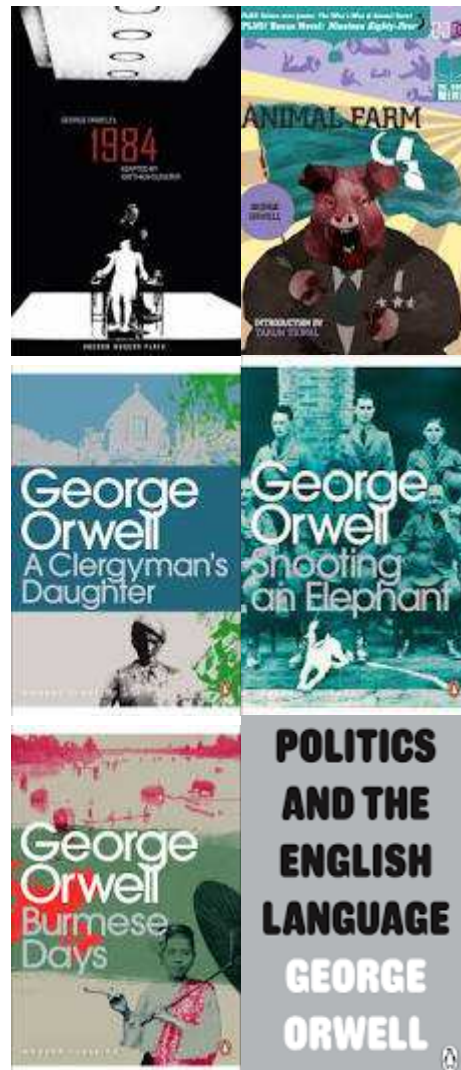
Some famous books of George Orwell