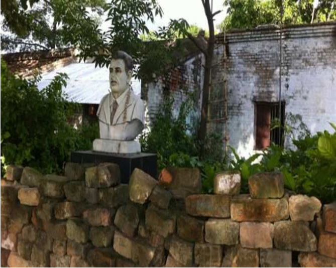
“George Orwell is one of the UK’s best-known 20th Century authors but he’s also claimed by a town in north-eastern India. Orwell was born here (Motihari) - and his home is being turned into a museum.” (BBC)

“One does not establish dictatorship in order to safeguard a revolution; one makes a revolution in order to establish a dictatorship.”