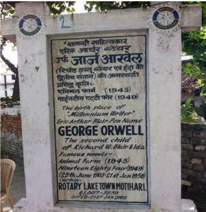
(Orwell Memorial site at Motihari)